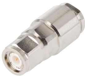
400PTM-C TNC Male for CNT-400 braided cable

OBSOLETE This product was discontinued on: February 25, 2015